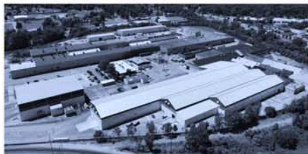
Fort Wayne plant, IN-USA (Total surface: 248.356 m 2 )