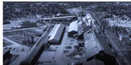
Welland plant, ON-CANADA (Total surface: 339.288 m 2 )