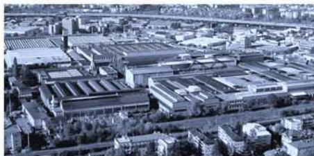
Bolzano plant, ITALY (Total surface: 197.049 m 2 )