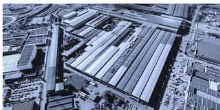
Vicenza plant, ITALY (Total surface: 294.608 m 2 )

Valbruna, founded in 1925 and leader in the production of Stainless steel and Nickel alloys long products, is underpinned by long experience and a highly qualified customer service.